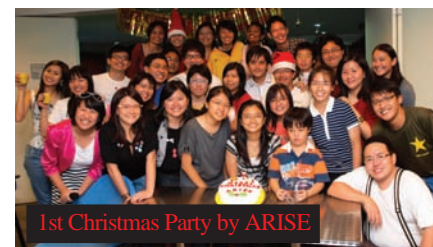
1st Christmas Party by ARISE