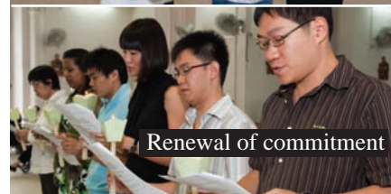
Renewal of commitment