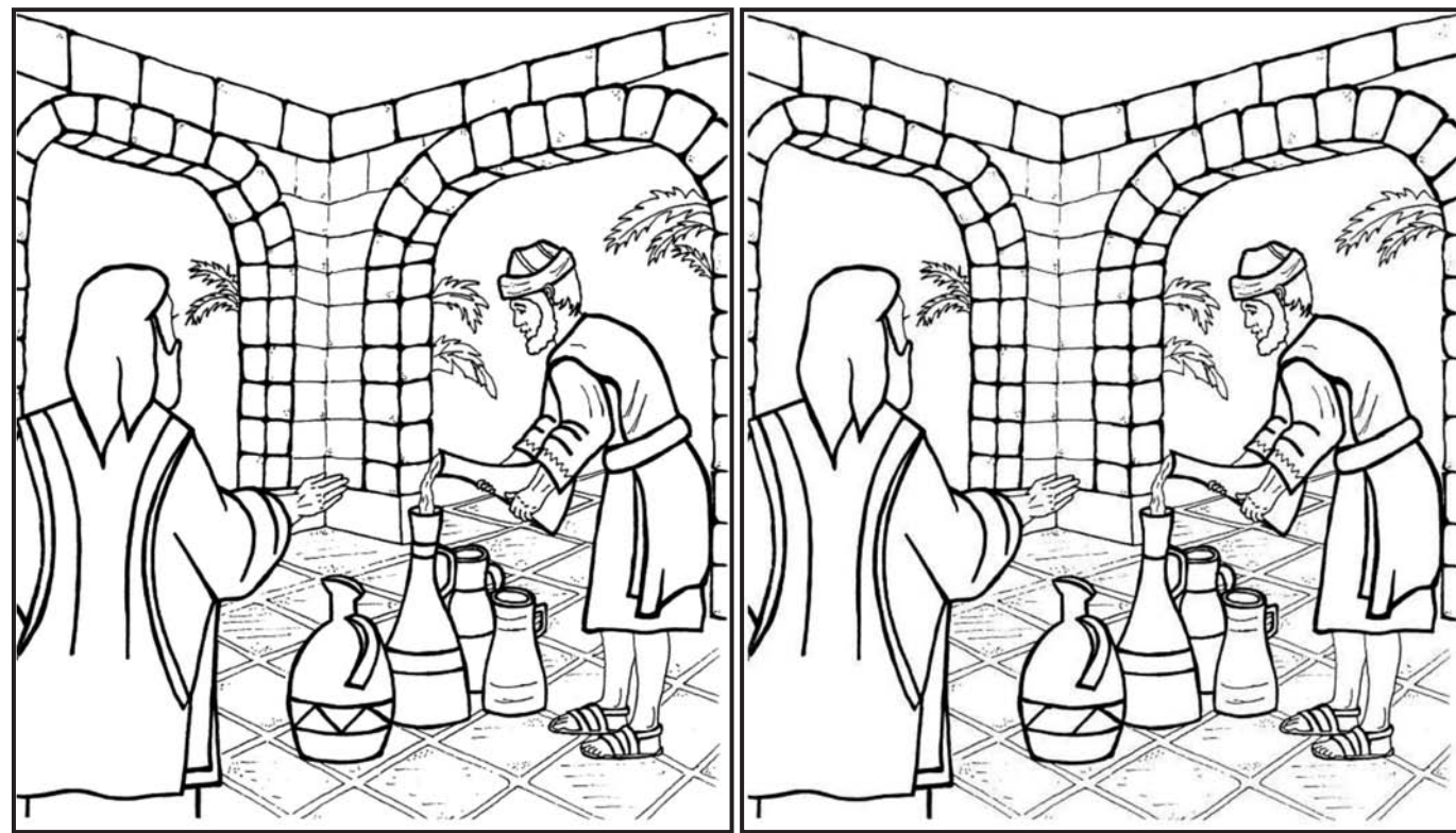
Kids Corner - Witness Jesus turning water into wine at the Wedding of Cana, and spot 5 differences in the 2 pictures below.